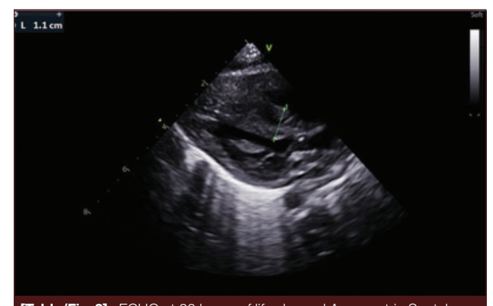
[Table/Fig-2]: ECHO at 26 hours of life showed Asymmetric Septal Hypertrophy (ASH), Interventricular Septal Distance (IVSd): 1.1 cm, Left Ventricle Posterior Wall Dimension (LVPWD): 0.5 cm; IVSd/LVPW=2.2 and markedly diminished left ventricular cavity.