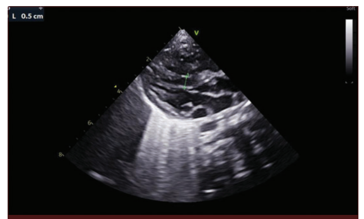
[Table/Fig-3]: ECHO at eight weeks of life showing significant resolution of septal hypertrophy. Interventricular Septal Distance (IVSd): 5 mm.

pressure. Respiratory distress decreased, and the baby was in room air within 48 hours of starting propranolol. Repeat sepsis screen was negative, and antibiotics were stopped at 72 hours. The baby was discharged on day six of life on oral propranolol. Follow-up ECHO at four weeks of life showed IVSd 0.7 cm (z-score=2.9), LVPW thickness 0.4 cm (z-score=1.6), resolution of LVOT obstruction, and propranolol was discontinued [Table/Fig-3]. Follow-up ECHO at eight weeks of life showed IVSd 0.5 cm (z-score=1.4). The baby had normal growth and development at four months of age with complete resolution of CH on ECHO [Table/Fig-4].