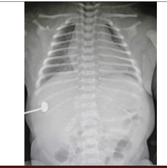
[Table/Fig-1]: Chest radiograph showed streaky opacities suggestive of wet lungs and cardiomegaly (CT ratio 0.70).

The infant was started on oral propranolol (1 mg/kg/dose every 8 hourly) with monitoring of blood sugar, heart rate, and blood